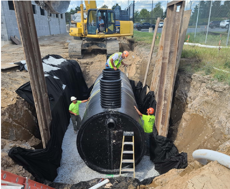
HDPE is resistant to corrosion.

KSI OGS UNITS COMPLY WITH 2018 MICHIGAN PLUMBING CODE CHAPTER 10, SECTION 1003.4